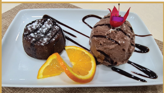
Lava Cake (Lava Cake, ice cream 7 )

250 g 233 Kcal / 974.87 Kj per 100g 28 LEI