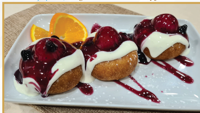
Papanași with blueberry jam and sweet sour cream sauce (papanași, sugar, sour cream 7 , berry jam)

250 g 277.01 Kcal / 1159 Kj per 100g 28 LEI