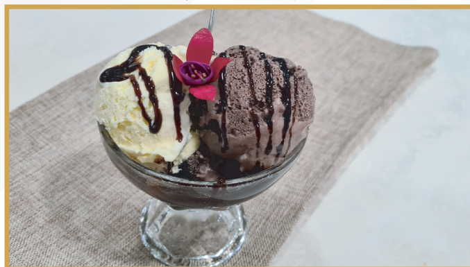
Vanilla and chocolate ice cream (ice cream 1,6,7 )

300 g 188.45 Kcal / 788.47 Kj per 100g 22 LEI