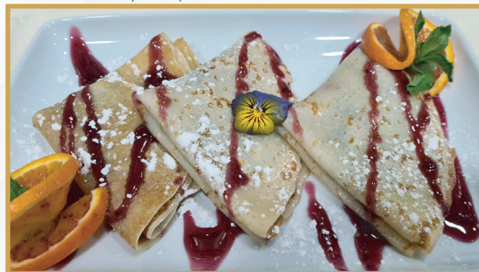
Pancakes with peanut butter (plain pancakes 1,3,7 , Nutella 8 )

200 g 302 Kcal / 1263.56 Kj per 100g 24 LEI