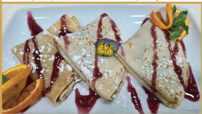
Pancakes with jam (plain pancakes 1,3,7 , assorted apricot jam)

200 g 226.42 Kcal / 947.34 Kj per 100g 24 LEI